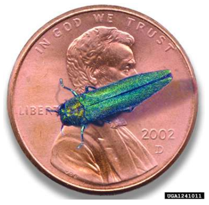
Figure 5. Emerald ash borer is a small insect with a billion-dollar impact to forestry.

Network 2018). Due to the extent of the outbreak and the challenges of locating and eradicating new infestations, regulatory agencies are seeking methods for managing this destructive pest throughout North America. EAB was first detected in Virginia in 2003 on infested nursery stock shipped illegally from Michigan to Maryland and planted in Virginia. As of August 2012, the entire state of Virginia came under state and federal EAB quarantines. As of 2018, EAB is found in 33 states (Emerald Ash Borer Information Network 2018).