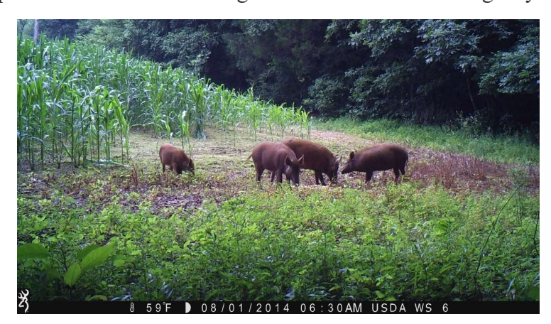
Figure 6. Feral hogs destroy crops.

addressing the feral hog problem. In partnership with U.S. Department of Agriculture Animal and Plant Health Inspection Service (USDA-APHIS), they have conducted field surveys, an education campaign, and animal removal with a goal of eradicating feral hog populations in Virginia (VDGIF 2018b).