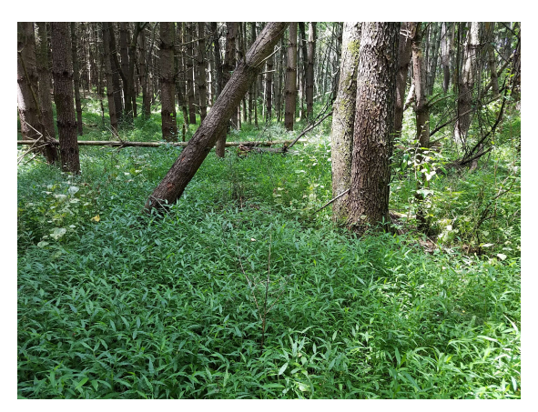
Figure 3. Wavyleaf carpets the forest floor.

Zebra mussel ( Dreissena polymorpha ), a freshwater bivalve native of Russia, spread during the 19th century to western Europe via trade through open waterways and canals. It probably arrived in the U.S. in the ballast of a transatlantic ship. It was first identified in 1988 in Lake St. Claire in Michigan, which connects Lake Huron and Lake Erie. Less than 10 years later, the zebra mussel was found in all five Great Lakes and the Mississippi, Tennessee, Hudson, and Ohio river basins. Adult zebra mussels grow to 2 inches in length and form dense colonies of as many as 1 million individuals per square meter (Benson et al. 2018). Colonies form on any hard surface, living or inanimate. Boats, pipes, piers, docks, plants, clams, and even other zebra mussels serve as viable substrate for this species. The zebra mussel's proliferation in U.S. waters has had negative economic and ecological impacts. The U.S. Fish and Wildlife Service has estimated $5 billion economic impact over a 10-year period. Costs are associated with activities such as cleaning and maintenance of water intake pipes, removal of shell buildup on recreational beaches, and control efforts (Benson et al. 2018). In 2002, the zebra mussel was discovered in a quarry pond in Northern Virginia. VDGIF led control efforts and successfully eradicated the invading mollusk in 2006 (Fernald and Watson 2013).