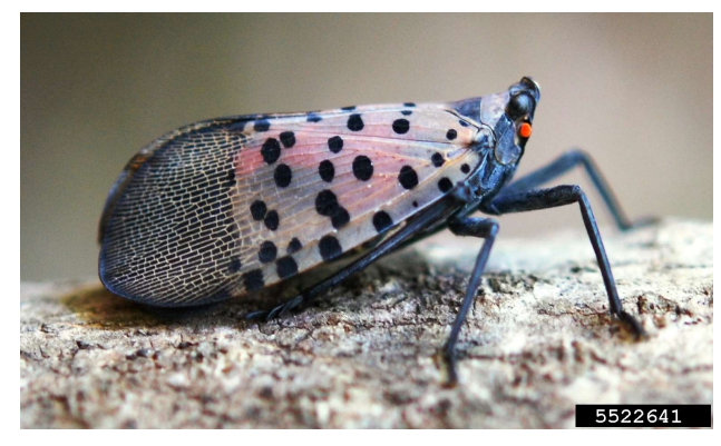
Figure 4. Spotted lanternfly feeds on crops such as grapes, peaches, hops, and apples.

Spotted lanternfly (Lycorma delicatula). The spotted lanternfly (SLF) is a planthopper that is native to China, India, Japan, Korea, and Vietnam. The first detection of SLF in the U.S. was in 2014, when it was confirmed in Pennsylvania. Its range has expanded since then, and it was discovered in Virginia in January 2018. The SLF is highly invasive and can spread rapidly to new areas. It feeds on more than 70 host plants including grapes, peaches, hops, and apples, and is commonly associated