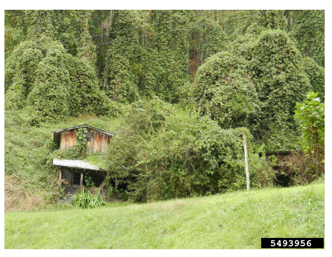
Figure 1. Kuzdu overtops trees and buildings.

Kudzu ( Pueraria montana ) is an invasive plant. Intentionally introduced to the U.S. from its native Japan for use in soil stabilization, kudzu became the "vine that ate the South."